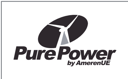
wedge is 50% black when on white background