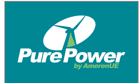
PMS 322 parts of logo go white when on PMS 322 background