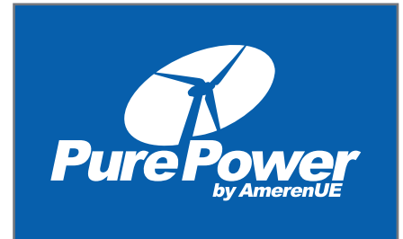
logo is all white when on other dark backgrounds