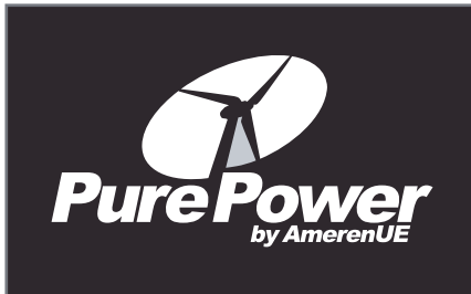
wedge is 27% black when on black background